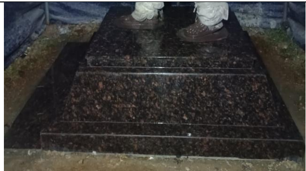
Current photo of Foundation above ground

Indian Mission to ASEAN intends to shift/ relocate the statue from the current place to a new place within ASEAN Hqrs premises. Exact location for new installation is in front of the Heritage Building of the ASEAN Secretariat. Detailed map of the revised location may be seen in the enclosed Annexure IV.