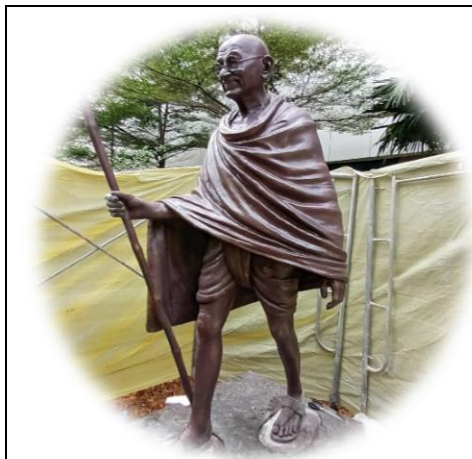
Current photo of the Statue

Indian Mission to ASEAN has installed a Statue of Mahatma Gandhiji in the lawn near new building of the ASEAN Hqrs, Jakarta. The foundation (width around 150cm x length 200cm) is made of concrete. The height of foundation above the ground is around 40cm; and under the ground approximately 100cm. Finishing of the foundation above the ground has been done with a granite stone. Mahatma Gandhi Ji's statue, made of bronze, weighing approx. 550kgs has been installed on the foundation. Height of the statue is around 193cm. Current photos are given below for better understanding: